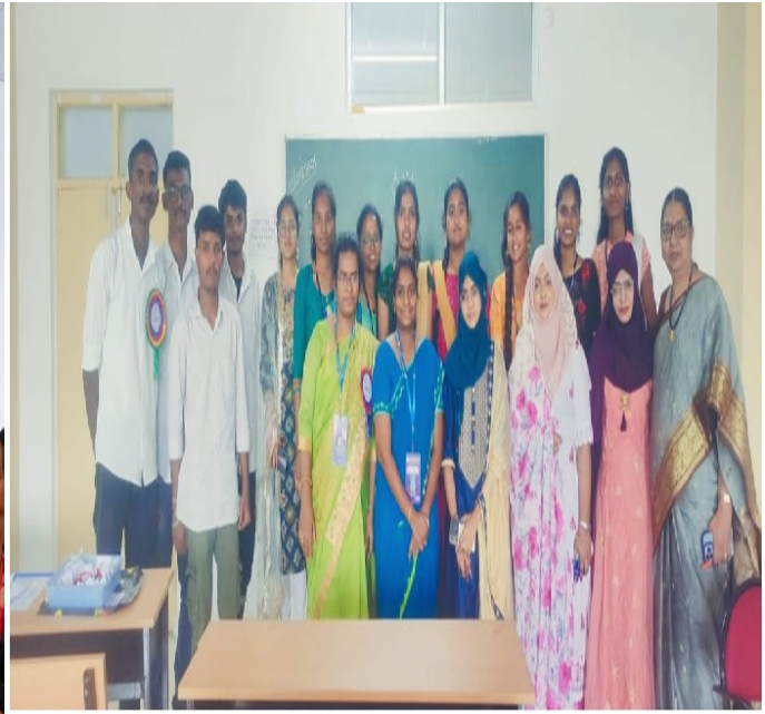
JUST A MINUTE SESSION