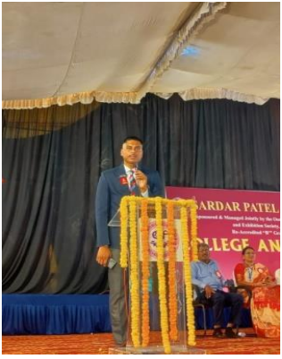
NCC cadet celebrated International Yoga Day 2023 at Secunderabad.