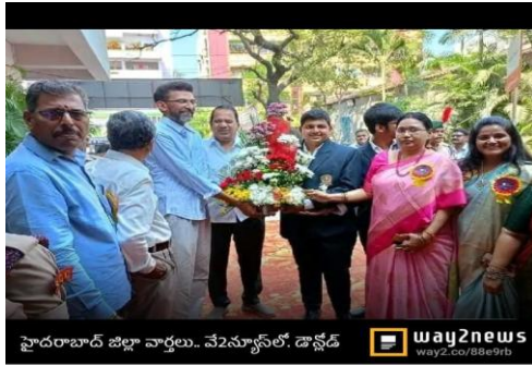
పద్మారావునగర్: సర్దార్ పటేల్ కాలేజీలో బిజినెస్ ఫెస్టివల్