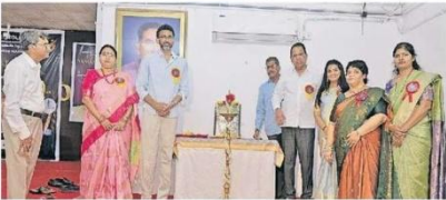
బిజినెస్ మేనేజ్మెంట్ ఉత్సవాలను ప్రారంభిస్తున్న దర్శకుడు శేఖర్ కమ్ముల

బస్సెలార్ పేజీ, మార్చి 21 : బిజినెస్ మేనేజ్మెంట్ రంగాన్ని ఎంచుకున్న యువత అందరినీ మెలుకువను నేర్చుకుని, స్వీకారానికి, సాంకేతికతను వినియోగించుకుని, వ్యాపారాలు మొదలుపెట్టి, బహువ్యక్తిలో గొప్ప వ్యాపారవేత్తలుగా ఎదగాలి, తమతో తగ్గిదండ్రులను, కాలేజీకి మంచి పేరు తీసుకురావాలని ప్రముఖ సీని దర్శకుడు శేఖర్ కమ్ముల అన్నారు. సికింద్రాబాద్, పద్మారావు నగర్ లోని సర్దార్ పటేల్