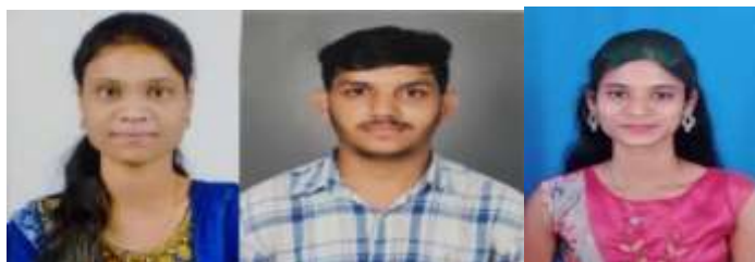
Microsoft PowerBI certificate awardees

WORKSHOP ON PROJECT INITIATION in collaboration with MANAC Infotech private ltd. We are organized on 3 rd March 2023.